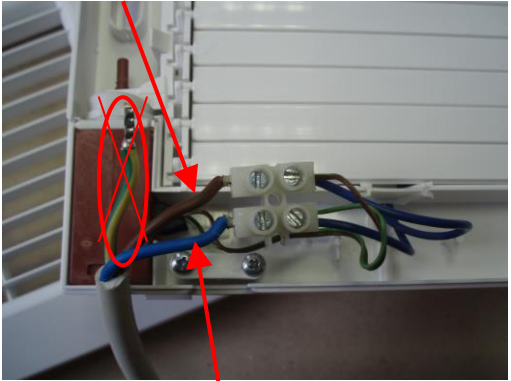
Directly earthed conductor - N