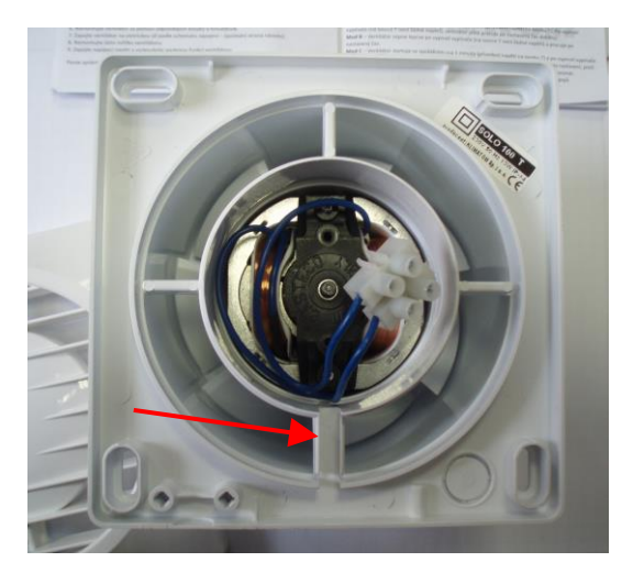
Place for service cable